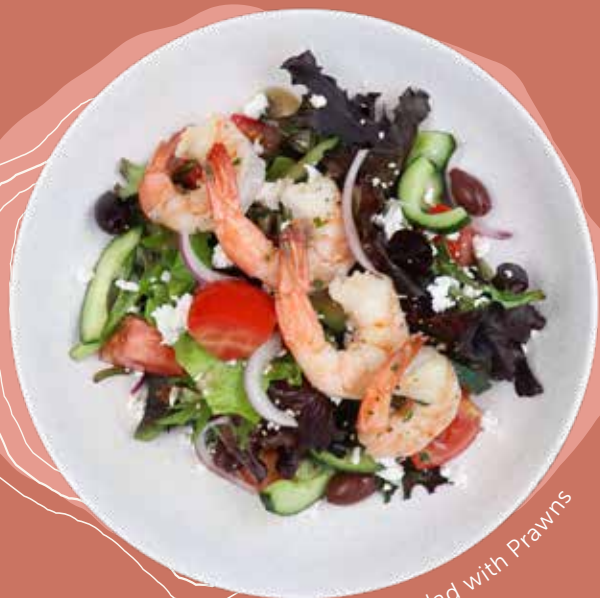
Greek Salad with Prawns