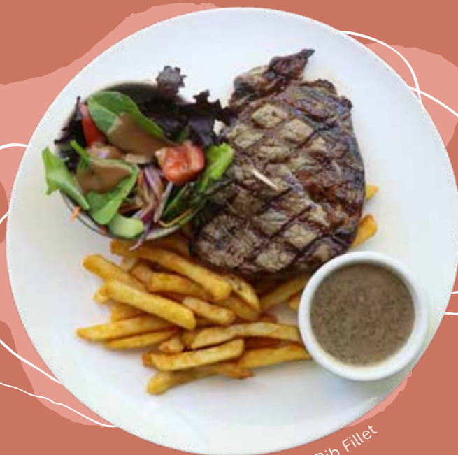
300g Black Angus Rib Fillet