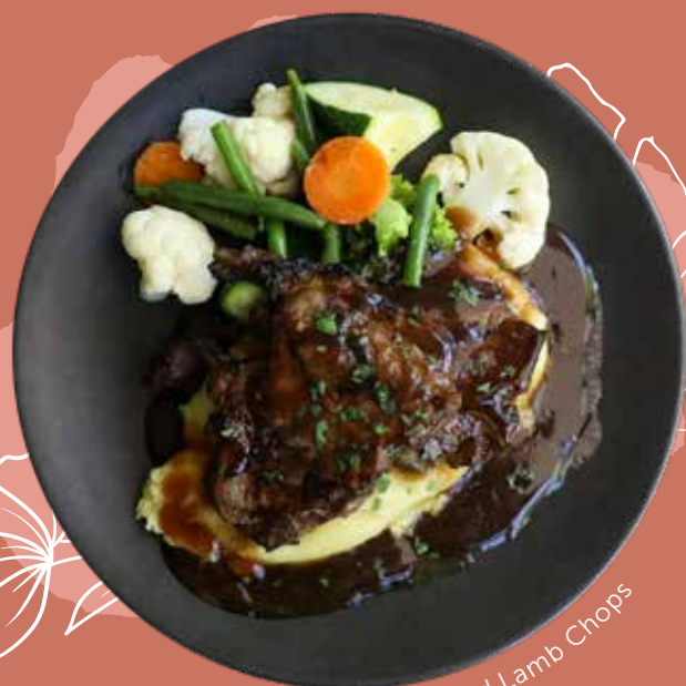
Native Bush Spiced Lamb Chops

Served on rosemary potatoes & seasonal vegetables, with a side of plant-based mayonnaise.